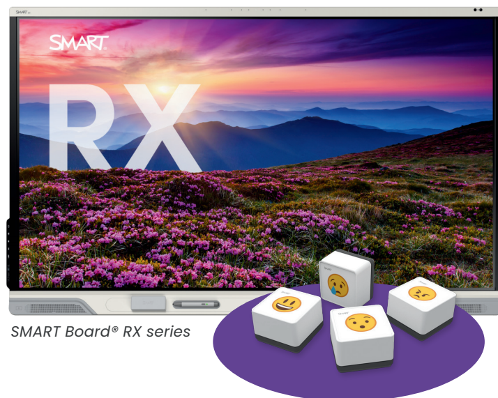
SMART Board® RX series

From customizable stamps to digital manipulatives to instructional audio and much more, SMART's Inclusive Classroom Bundle allows students to engage and participate in all learning experiences with relying on spoken or written language.