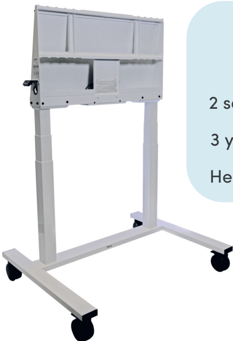
SMART FSE-500 height adjustable mobile stand

Height adjustable stand (optional upgrade)